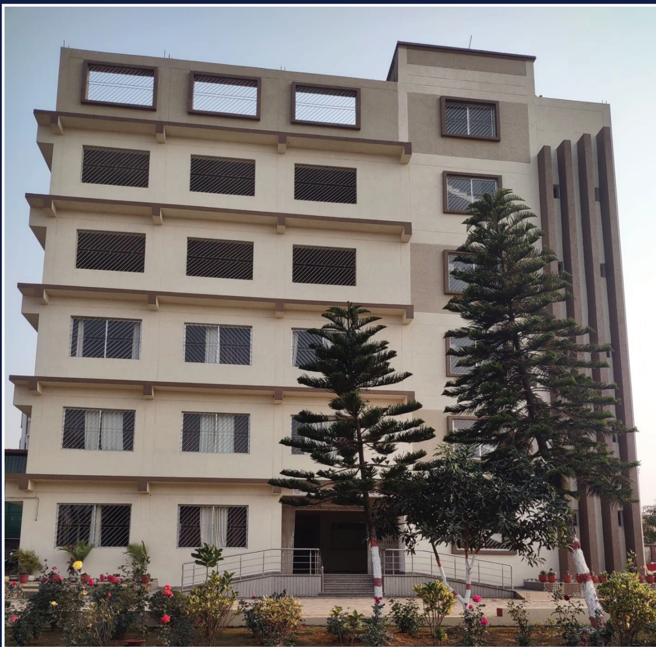
Justice S.B. Sinha Centre for Legal Research and Excellence